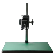
HM-AHBR01 SP Series Desktop Stand Bracket