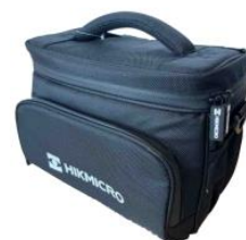
HM-SP01-POUCH M/G/SP Series Pouch